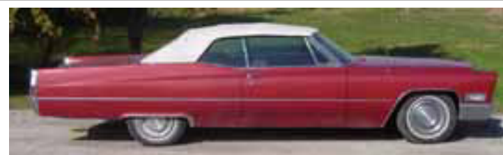
1968 CADILLAC DEVILLE CONVERTIBLE 472 V-8, original interior, excellent shape!

COLLECTOR ITEMS • 1968 Cadillac Deville convertible 472 V-8, original interior, excellent shape • 6' immigrants trunk • Cedar Strip Canoe, completely hand made, hand finished, and one of a kind collector's item. Call or email for a photo.