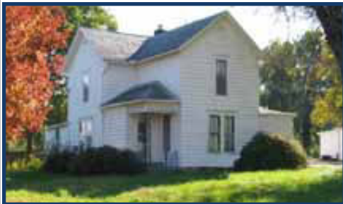
Parcel #2: 613 Brunswick Brookfield

Parcel #1: 1012 North State, Brookfield, Missouri Two story, 3 bedroom home with garage and carport in a nice neighborhood. This home will be open for inspection Saturday, November 12 th from 10:00-11:30 AM.