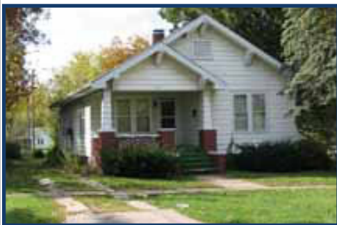
Parcel #4: 215 West Gracia Marceline

Parcel #2: 613 Brunswick, Brookfield, Missouri Two story, 3 bedroom, 1 1/2 bath home with new hot water heat system, 2 car garage, shop and small barn. This property open for inspection Saturday, November 12 th from 10:30 AM - Noon.