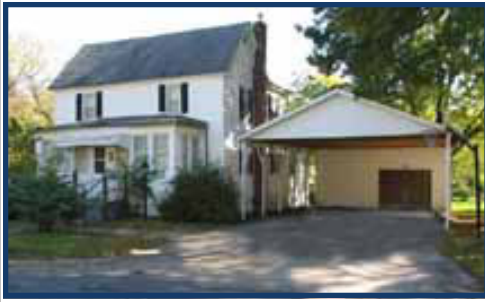
Parcel #1: 1012 North State Brookfield