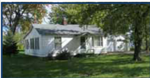
Parcel #5: 405 East Hauser (WW) Marceline