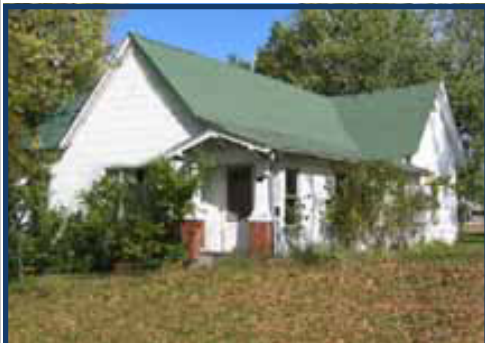
Parcel #6: 316 West Howell Marceline

Parcel #15: 1101 Pershing Drive, Laclede, Missouri. Residential – unoccupied